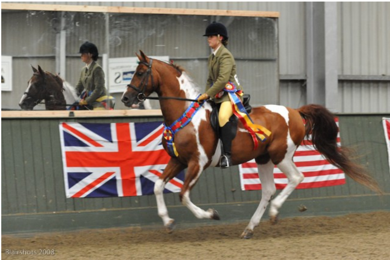
Photo: Even Worse Last year's European Saddlebred Performance Champion.

EUROPEAN CHAMPIONSHIP SHOW for AMERICAN SADDLEBREDS & Open Pleasure Show for ALL BREEDS